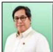
HON. TEODORO J. HERBOSA, MD Secretary of Health