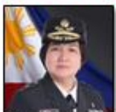
BGEN. FATIMA CLAIRE NAVARRO Surgeon General Arm Forces of the Philippines