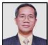
HON. JOSE Y. CUYETO, JR. JRC Commissioner